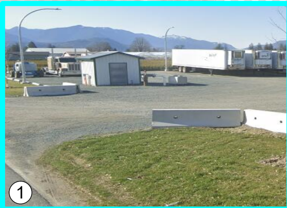
1 Cyan hatched area depicts TCPr location and escape route. Photo above depicts TCPr location and escape route