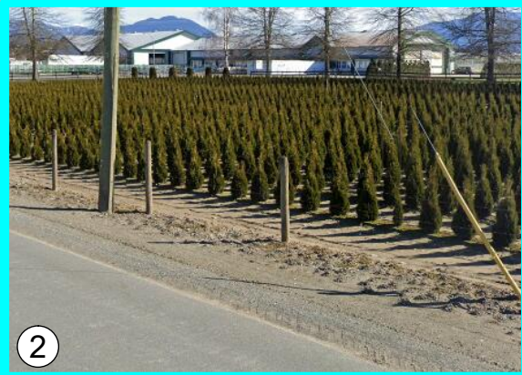
2 Cyan hatched area depicts TCPr location and escape route. Photo above depicts TCPr location and escape route